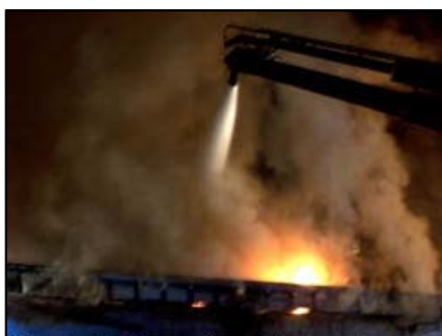
Smoke bellows from the roof as water is sprayed onto the flames.

North Wilkesboro along with equipment and personnel from Wilkesboro, Cricket, Broadway, Roaring River and Millers Creek fire departments.