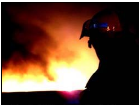
A North Wilkesboro firefighter mans a truck as the fire rages.

Fire destroyed the NAPA auto parts store on D Street in North Wilkesboro early Tuesday morning.